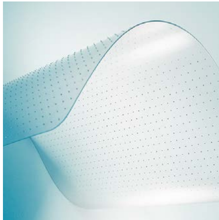
For carpets with anchor grips