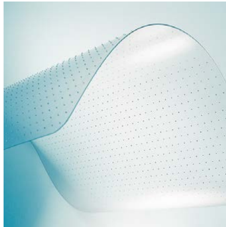
For carpets with anchor grips