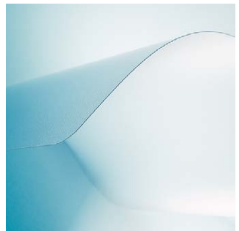
For hard floors with VAB®-antiglide layer